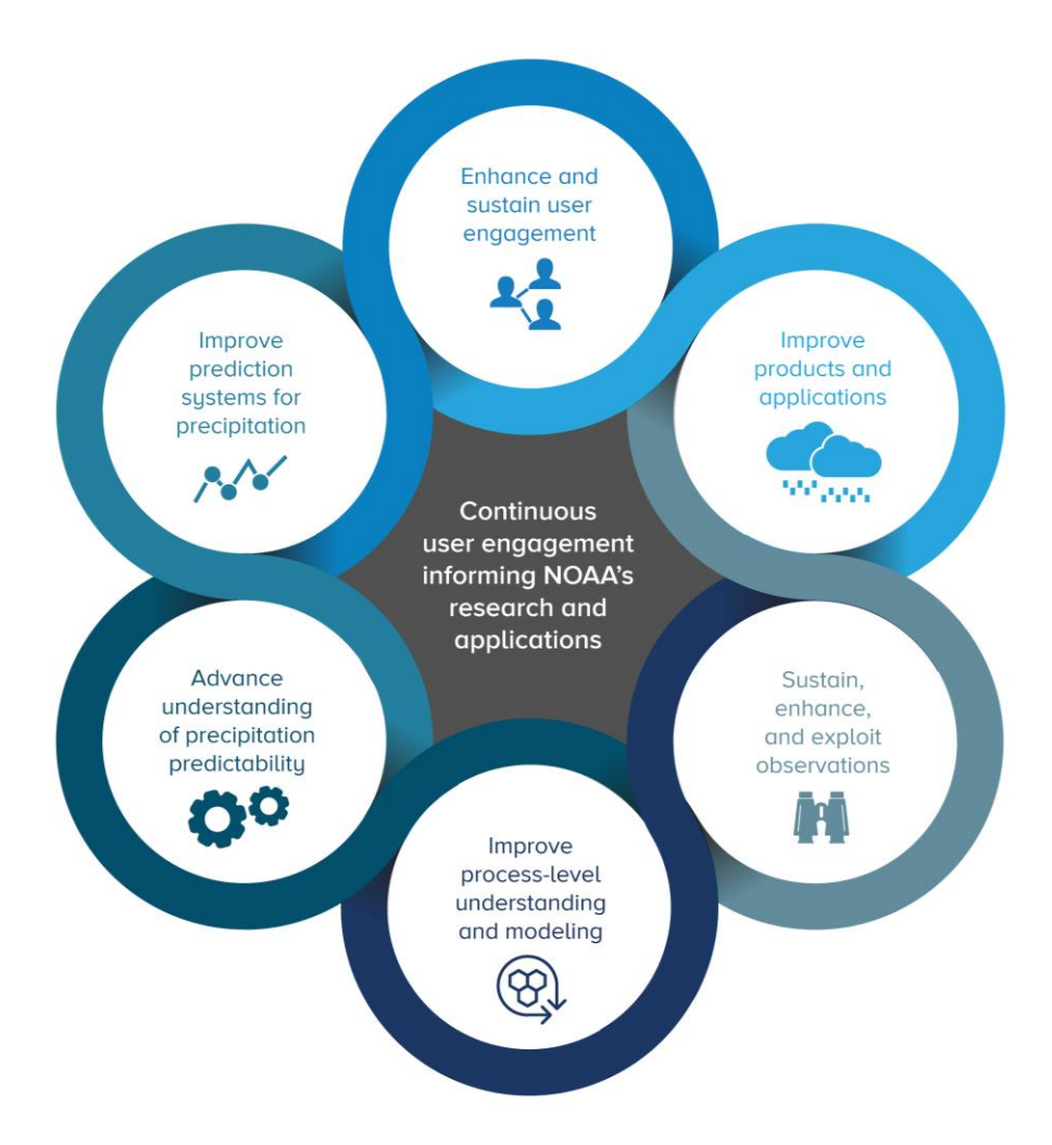
Figure 3. Precipitation Prediction Grand Challenge Strategic Objectives

In order to advance the way NOAA does business, these objectives will be accomplished in partnership with EPIC's drive to develop the world's most accurate and reliable operational modeling system. In particular, the Precipitation Prediction Grand Challenge and EPIC will work together to: