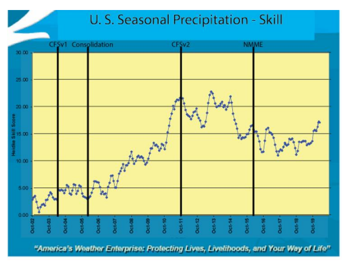
Figure 1. U.S. Seasonal Precipitation Skill

These needs for accurate precipitation forecasts over land and ocean have increased over time even as precipitation forecast skill has been declining (see Figure 1). Today's state-of-the-art global coupled models exhibit systematic errors that are as large as the real precipitation signal NOAA is trying to model and the magnitude of these errors has remained essentially the same since the late 1990's.